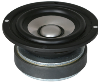
FE85 fullrange driver