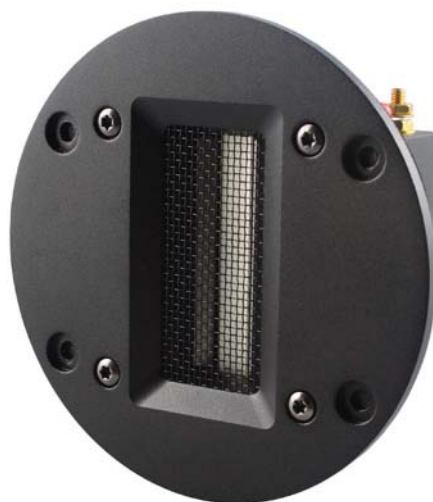
NeoCD3.0 True Ribbon Tweeter